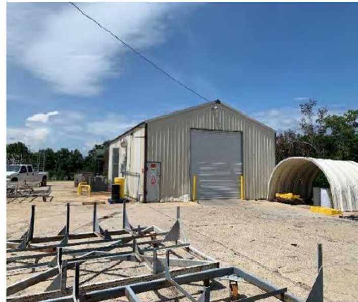
CHEMICAL STORAGE BUILDING

The information provided for by the company is subject to errors, omissions, changes, prior sale or lease and withdrawal from the market without notice by the owner. This information has been gathered from sources that are deemed to be reliable, however there is no warranty or guarantee to its accuracy or validity. You are hereby advised to independently verify the information presented herein.