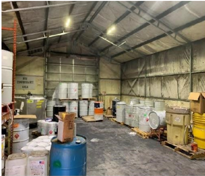
CHEMICAL STORAGE BUILDING